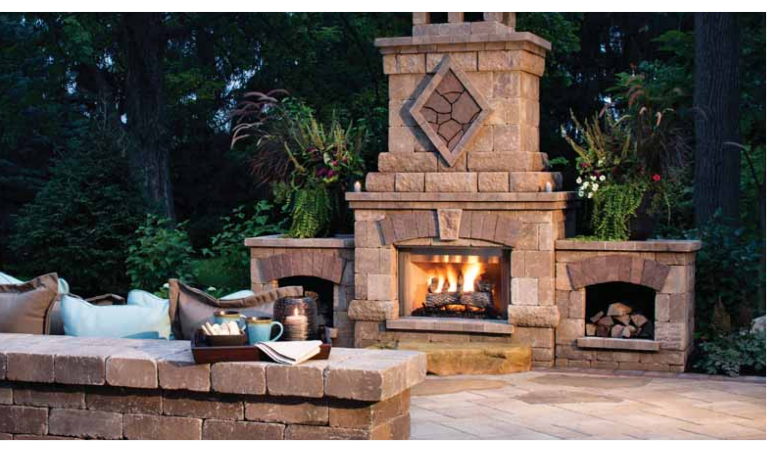
Belgard<sup>®</sup> Elements Bristol Fireplace/ Weston Stone<sup>®</sup>/ Lafitt<sup>™</sup> Paver