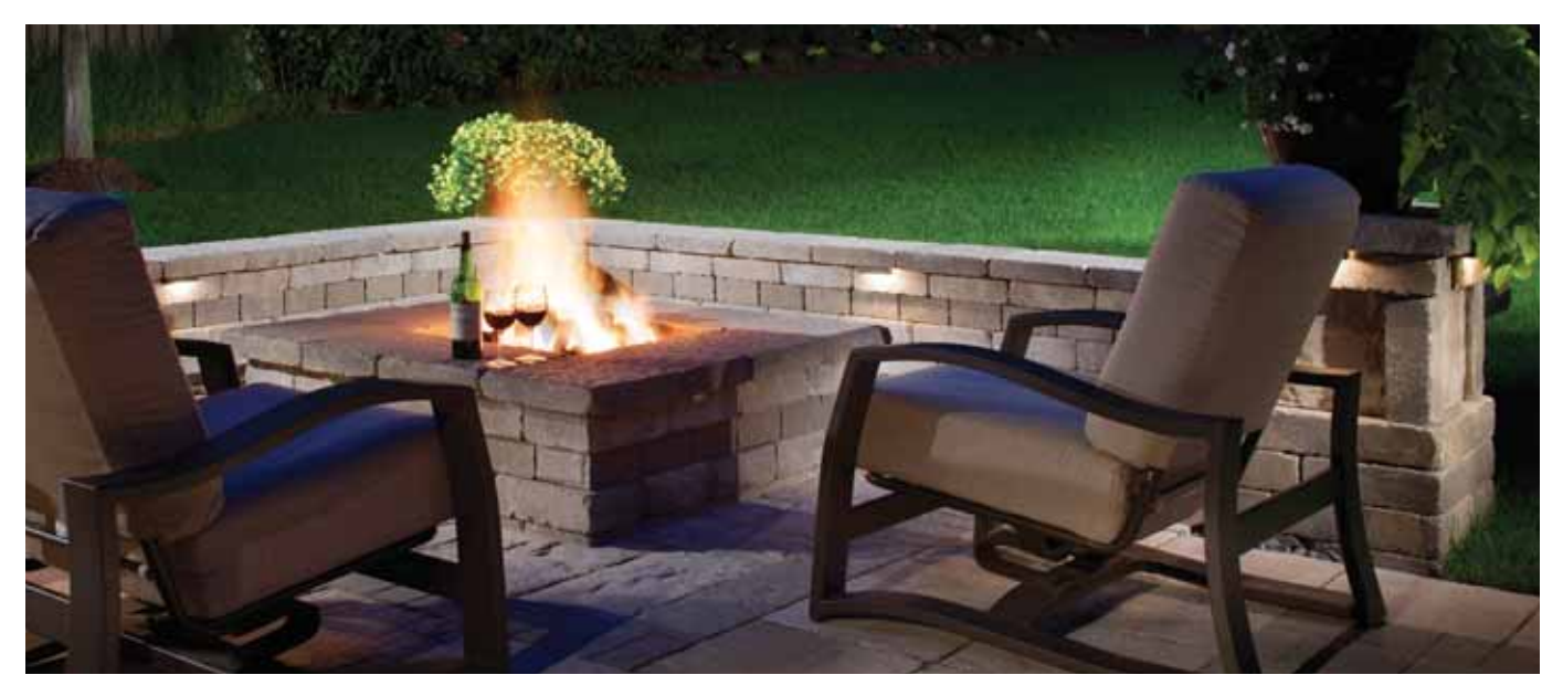
Mega-Lafitt<sup>™</sup>/ Weston Stone<sup>®</sup>