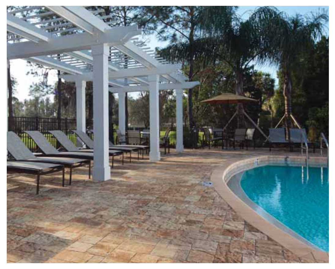
Lafitt<sup>™</sup> Paver/ Bullnose Coping