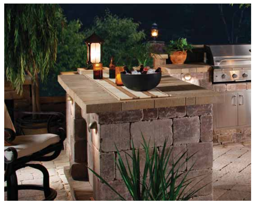
Belgard<sup>®</sup> Elements Grill Island

» Find a local contractor at Belgard.com/Gallery