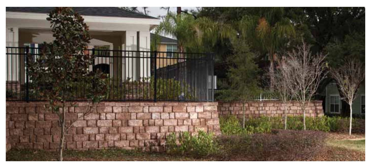
Anchor Diamond Pro Stone Cut®