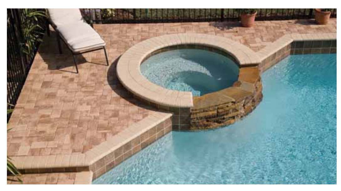
Dublin Cobble<sup>®</sup>/ Bullnose Coping