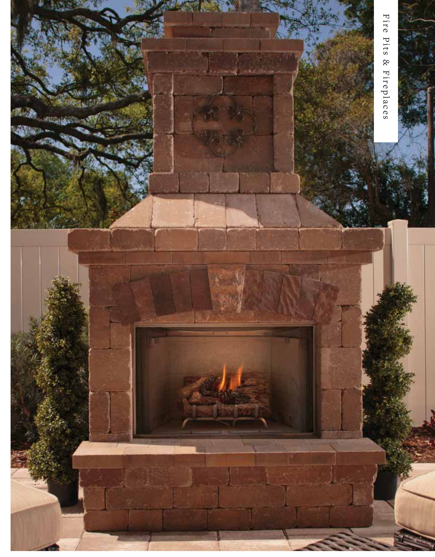
Belgard® Elements Brighton Fireplace